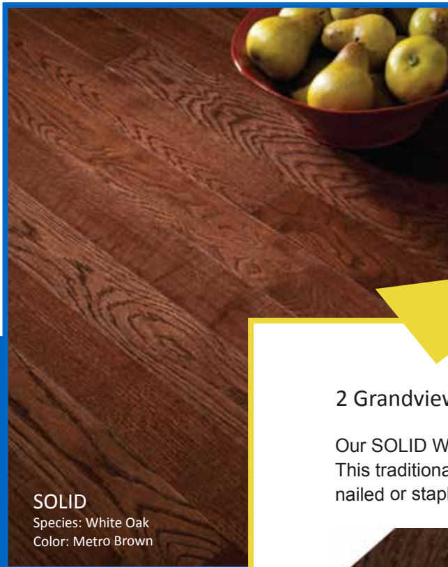
SOLID Species: White Oak Color: Metro Brown