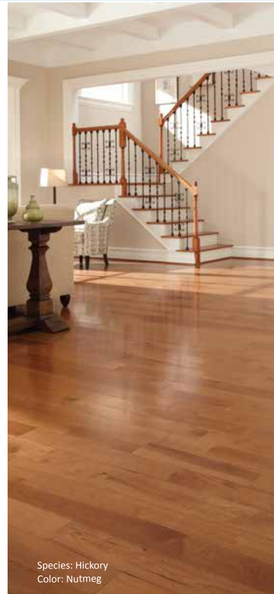
Species: Hickory Color: Nutmeg