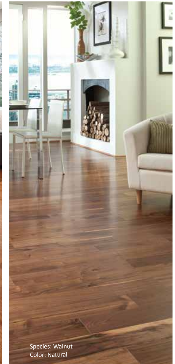
Species: Walnut Color: Natural