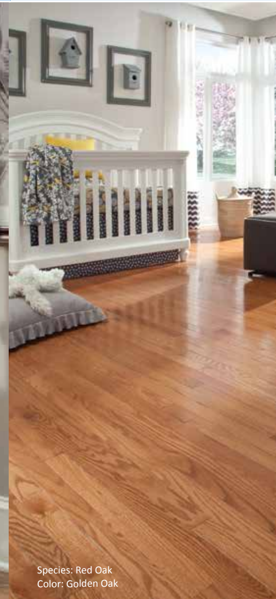
Species: Red Oak Color: Golden Oak